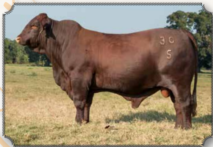
SIRE OF LOT 70 HARRIS 30/5

Adj. REA/CWT 1.09, Adj. %IMF 2.5, Adj. SC 34 cm