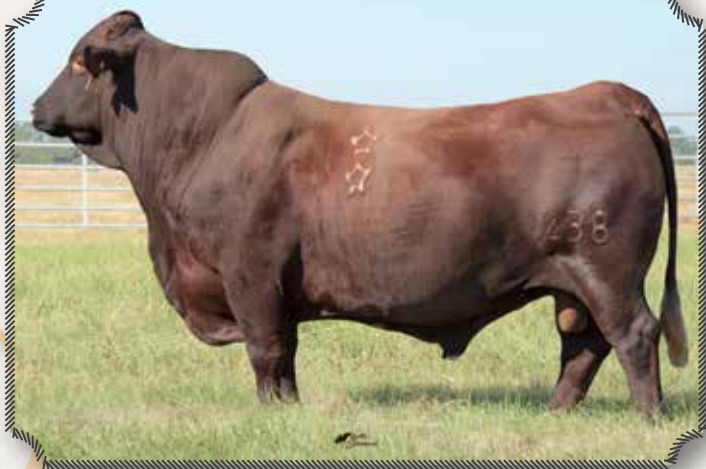
SIRE OF LOTS 253 & 254 CA/RDF MATEO 7238