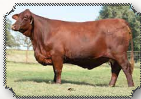
FULL SIB TO DAM OF LOT 286 HARRIS 958 724F7