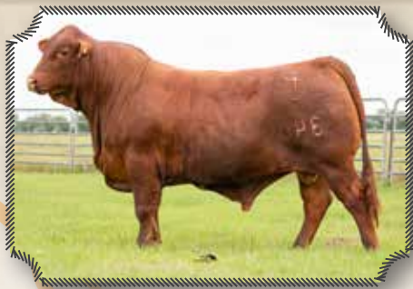
NATURAL SERVICE SIRE TO LOT 253 DYNAMIC 340