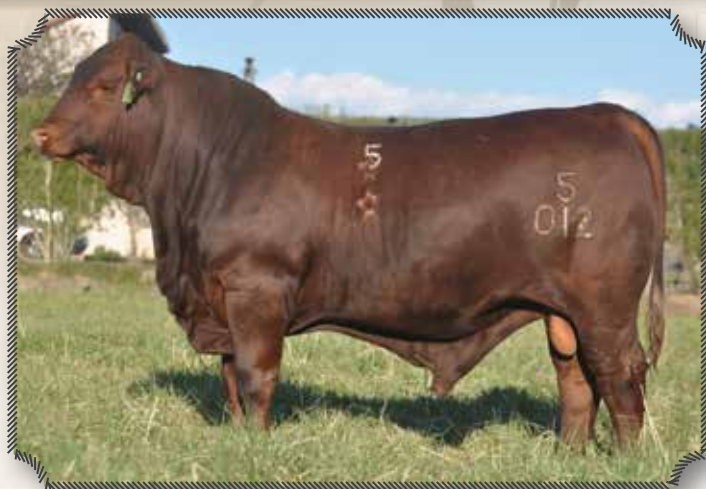
SIRE OF LOT 73 RED DOC NEVER SANK 5012

Adj. REA/CWT 1.21, Adj. %IMF 4.8, Adj. SC 38 cm