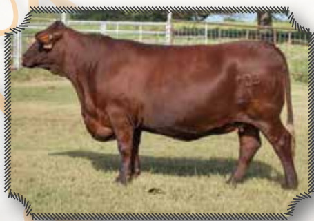
MATERNAL GRANDDAM OF LOT 286 HARRIS FARMS 003/1