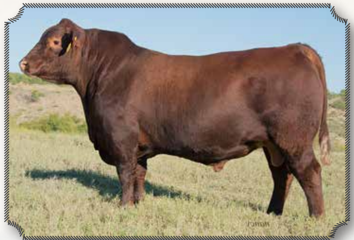
PATERNAL GRANDSIRE OF LOTS 77,78,79 BROWN AA SENSATIONAL B5147

Adj. REA/CWT 1.1, Adj. %IMF 4 Adj. SC 36 cm