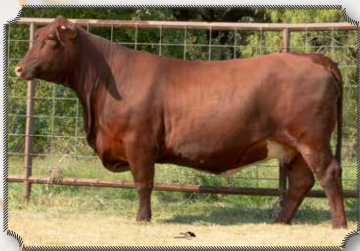
DAM OF LOT 228 RED DOC 7150

Open-Never Exposed 7150G is sired by Harris Navidad 8/5 and out Red Doc 7150 that is the partnership donor owned with Quail Valley Farms. 7150G ranks in the top 45% for 11 EPD traits Adj. REA/CWT 1 Adj. %IMF 5.9