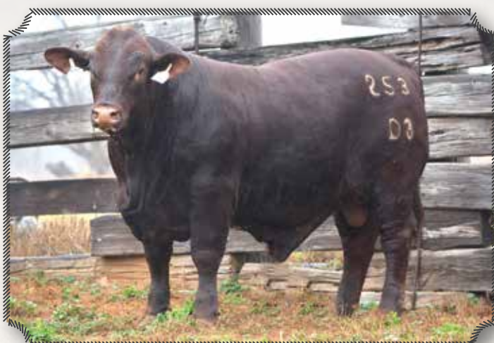
FULL BROTHER TO DAM OF LOTS 13,14,15 HARRIS 253D3

253H9 is sired by KR Data Driven 143/17 and out of 253D4 who is a full sister to Capone 253D3. He writes 10 EPD traits in the top 15%. Adj. REA/CWT 1.14, Adj. %IMF 4.3, Adj. SC 38 cm