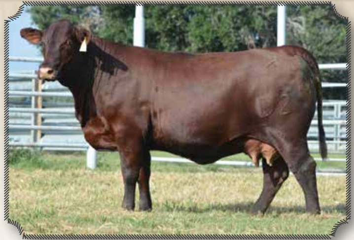
DAM OF LOT 205 BRIGGS 1515D2

Briggs 1515G is sired by Briggs 3006C2 and out of Briggs 1515D2 who has an average calving interval of 368 days after 3 calves. 1515D2 also sells in this year's Fall Bred Cow offering. Briggs 1515G ranks in the top 25% for 7 EPD traits. Adj. REA/CWT 1.14, Adj. %IMF 3.3