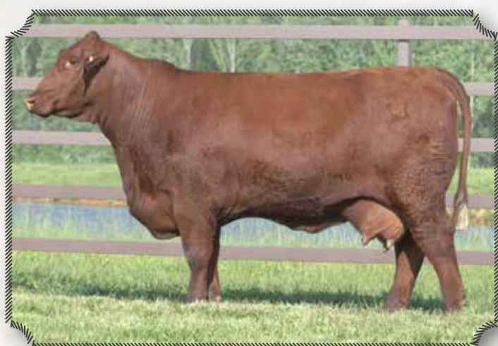
PATERNAL GRANDDAM OF LOT 226A HARRIS 82/4