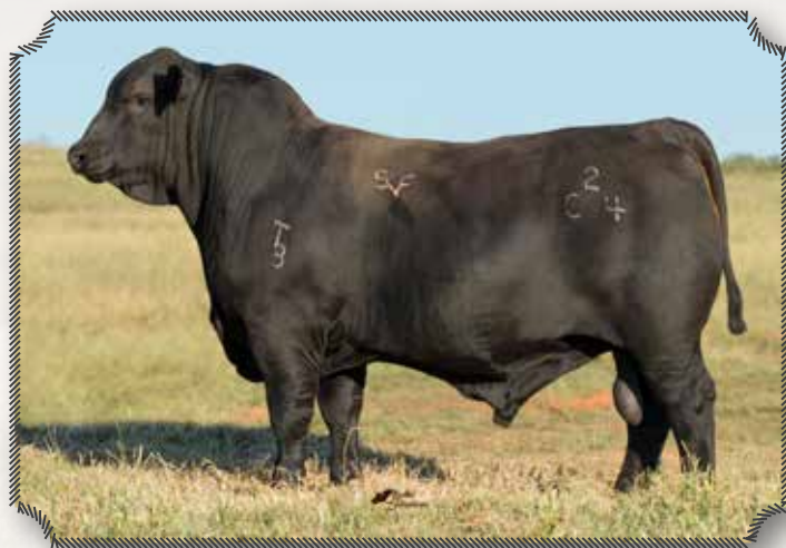
PAT. GRANDSIRE OF LOTS 219A,220A,222A T3 PASSPORT 2C4

3/4 Santa Gertrudis x 1/4 Brangus Briggs 170J is sired by Briggs 930E5 who is a Red Super American (1/2 Santa Gertrudis x 1/2 Brangus) sire we kept to grade up from his stellar Brangus dam. All of 170J's calves will be SGBI Purebred Registered if sired by a Santa Gertrudis bull. Briggs 170J ranks in the top 20% for 6 EPD traits.