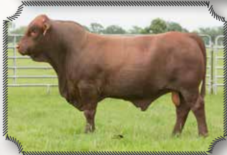
SIRE OF LOTS 256 & 257 CA/RDF SALVADOR 6272