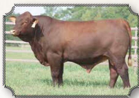
SON OF RED DOC 5369 QVF JACKPOT 5369G8