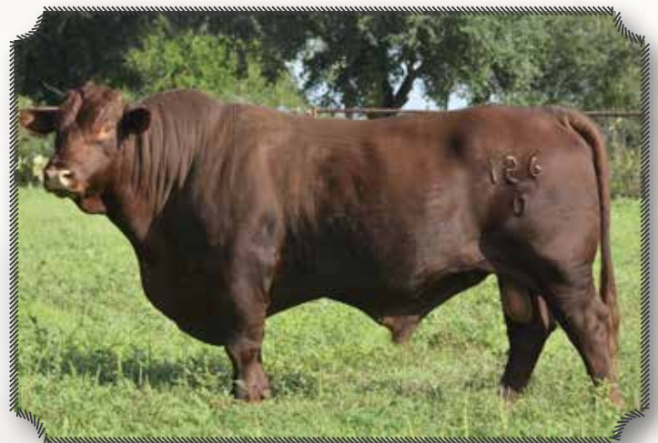
SIRE OF LOT 21 AJH 126/0