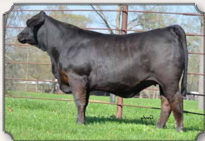
DAM OF LOT 104 MS DMR ROLL TIDE 302C5

He is a good son of the $16,000 Marlboro and out of our 302C5 donor. He boasts top 3% REA with top 20% WW, 25% YW EPDs and top 25% Terminal Index.