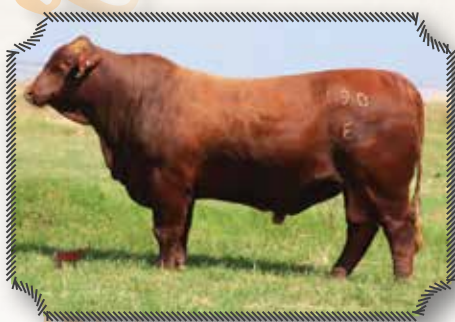
SIRE OF LOT 285 HARRIS FARMS 190E