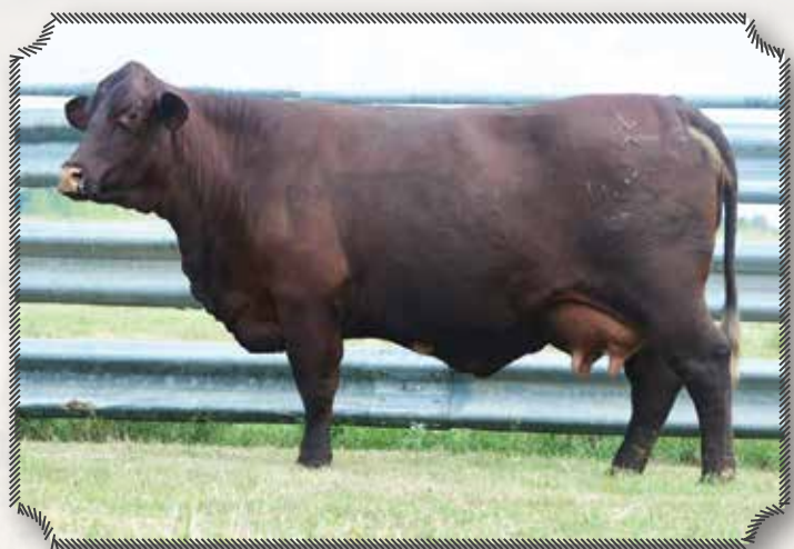
DAM OF LOT 279 033 BRIGGS 635D2

Briggs 635H8 is sired by 607E3 and out of Briggs 635D2 who sells in this year's sale in the Fall Bred Cow offering. Briggs 635H8 ranks in the top 50% for 6 EPD traits. Scan data provided at sale time.